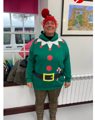
IT'S LAST YEAR'S PIC, BUT WE COULDN'T RESIST!